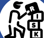
Advisory & Risk Assessment Services