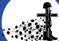
Battlefield Area Clearance (BAC)