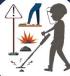
Manual Mine Clearance