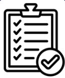
Non-Technical Survey (NTS)

Safi Demining Group (SDG) provides comprehensive and professional mine action and explosive hazard management services designed to ensure safety and support development projects. Our services include non-technical and technical surveys, manual and mechanical mine clearance, Explosive Ordnance Disposal (EOD), and battlefield area clearance. We also offer site clearance and risk assessment services for infrastructure and construction projects, ensuring safe land access for implementation. All operations are conducted in accordance with international standards, with a strong focus on safety, quality, and operational efficiency.