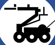
Mechanical Mine Clearance