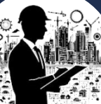
Infrastructure Project Clearance