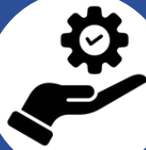
Technical Survey (TS)